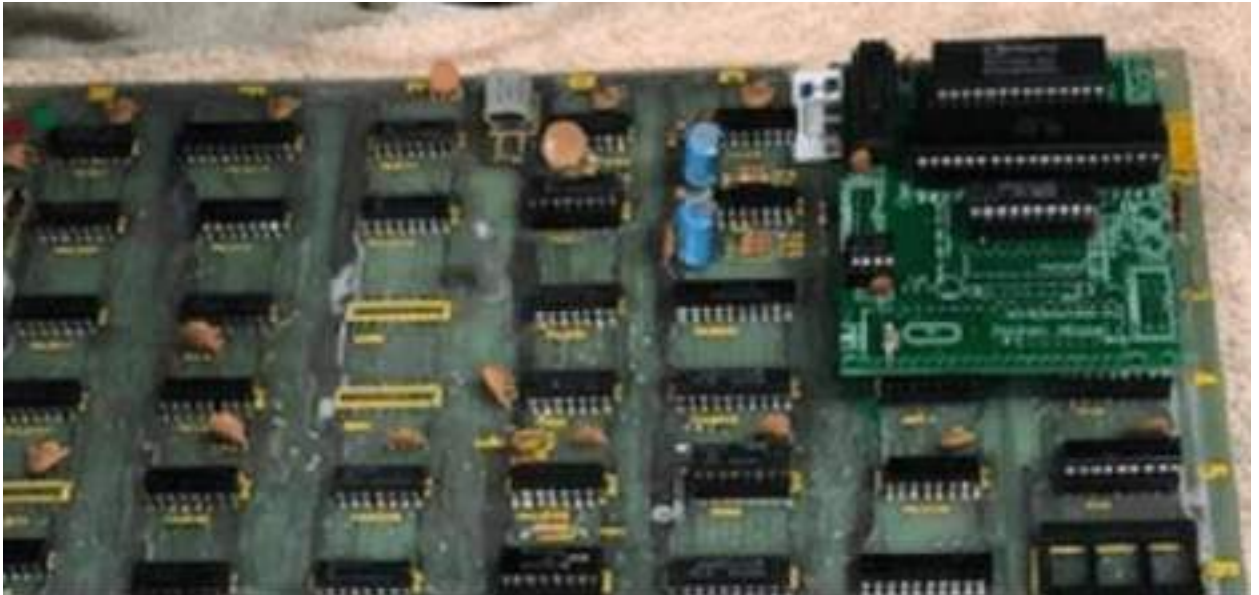
Close up view –

With the 6502 removed, install the 6502 on the kit (note the Pin1 direction, it will be the same way when you removed from your pcb). Then, install kit on your pcb as shown.